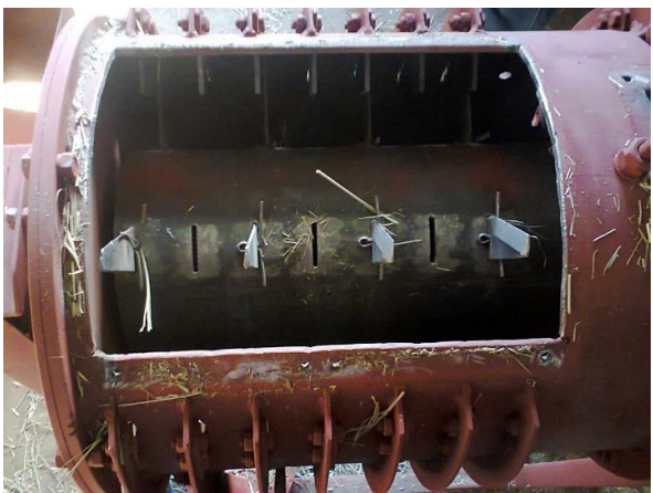
Fig. 1. Working chamber of the chopper (with removed loading mouth)

The experimental sample of the chopper had the following main design parameters: diameter of the working chamber -315 mm; rotor diameter -159 mm; working length of the rotor (distance between the outside planes of the knives) -600 mm; distance between knives (counter cuts) -40 (80) mm; number of knives in one plane -2 (4) pieces; the maximum number of countersinks in one plane -5 pieces; angle of sharpening of knives -15 \pm 5 degrees; sharpening angle of counter-cuts -45 \pm 5 degrees.